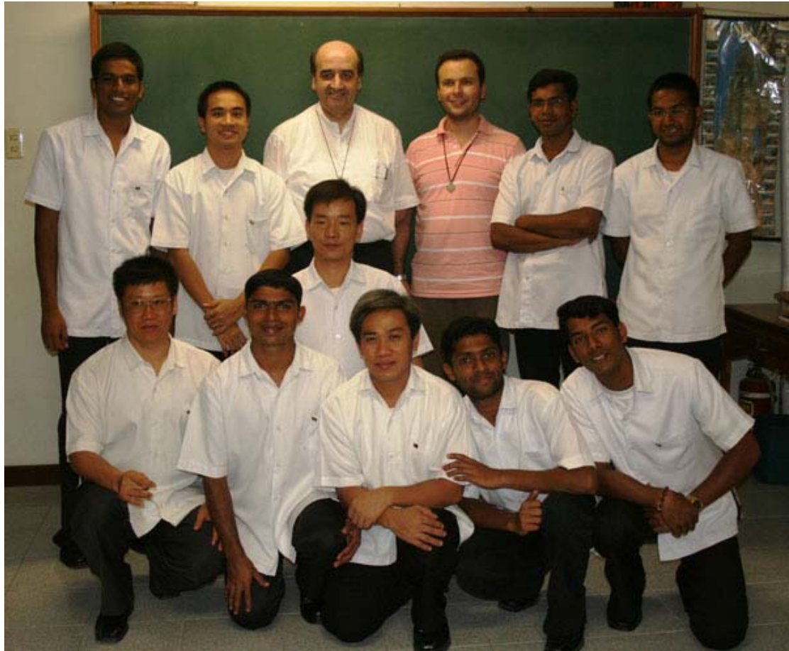
The Noviciate house after the Fr. General talked to the novices.